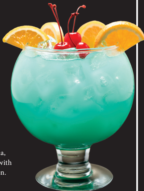
BLUE OCEAN For two or more.