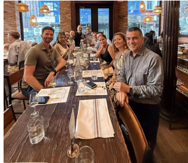
Distributor Tequila hour