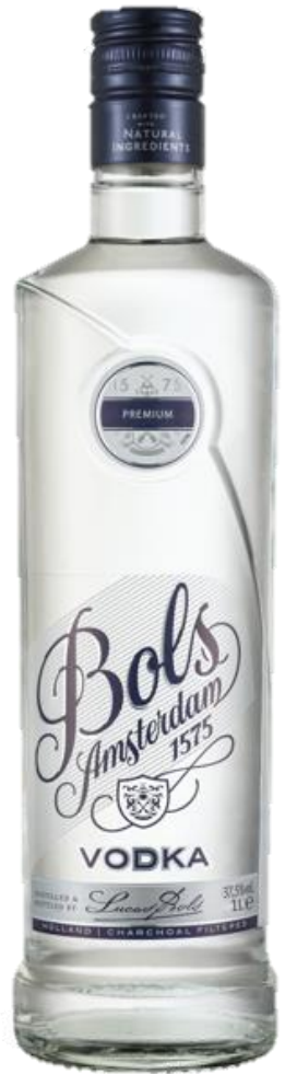
...The World's First Cocktail Brand