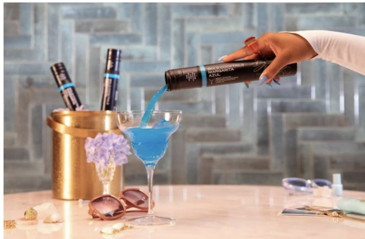
Bols Cocktails' Margarita Azul.